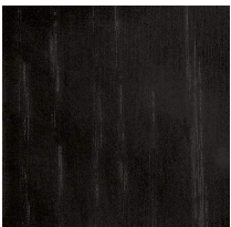
Black stained open pore ash