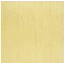
Satin brass colour lacquered metal